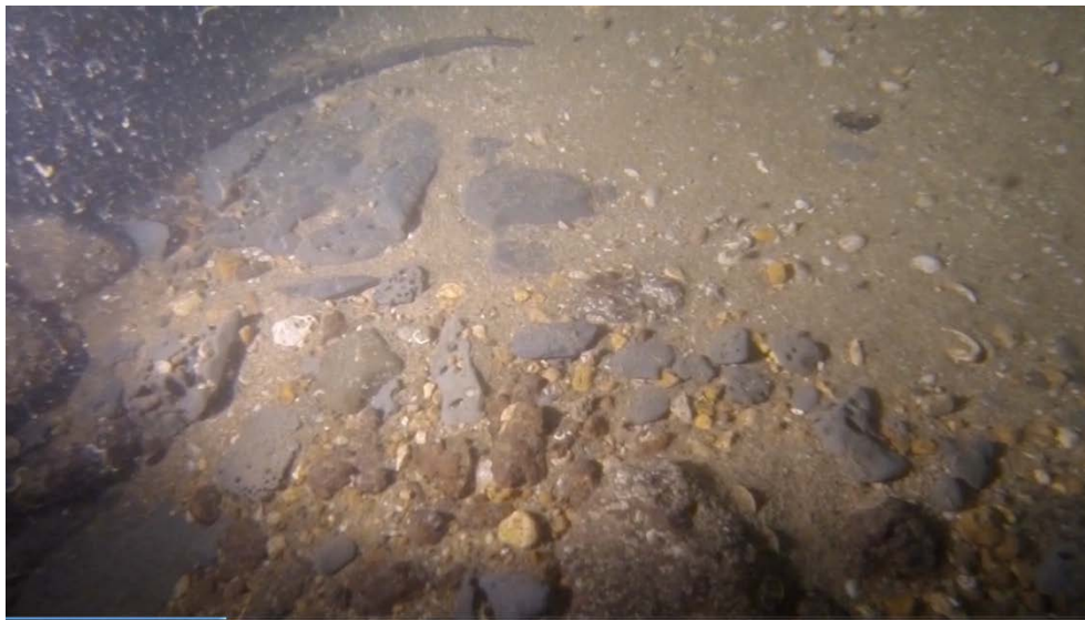
Figure 3: The seabed around the Westville is a mixture of sand and shingle

The remains of SS Westville lie in around 40m depth of water on a sand and shingle seabed (Figure 3) and are moderately intact. The wreck is leaning half over onto its port side with the bow, which is quite broken up, towards the south east.