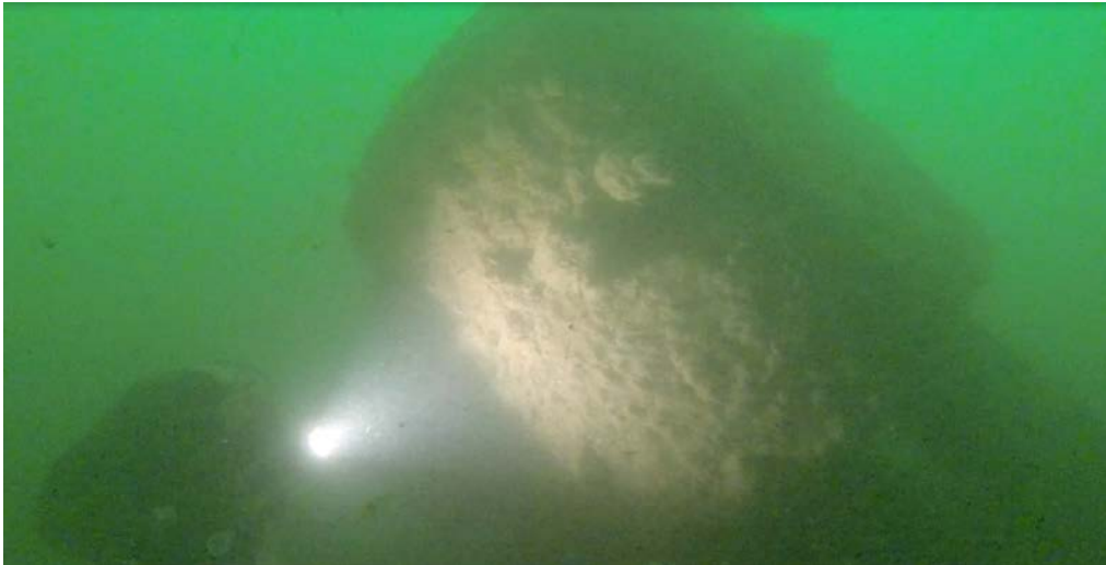
Figure 7: Looking up at the engine machinery