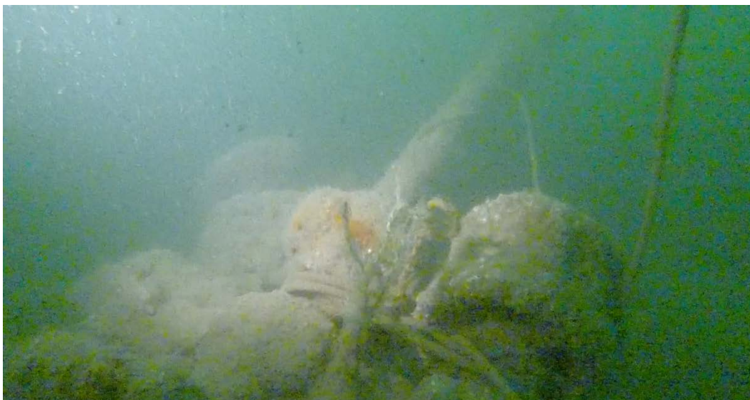
Figure 6: Winch, rope coiled around a drum to the left of the image

The highest point of the wreck is around amidships section with one of the boilers in this area having rolled out of its original position. The large triple expansion engine just behind has a large section of the hull resting against it as it tilts over still on its substantial legs (Figure 7 and 8).