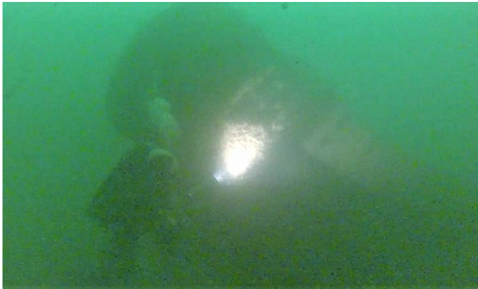
Figure 8: The legs of the engine can just be seen to the right side of the image

At the stern the four bladed propeller can be seen resting on the seabed (Figure 9 and 10) and the gun is still present at the stern although this was not encountered on this occasion. Coming forward from the stern along the starboard side access to the hold is possible in the aft part of the wreck, and a deck winch is present on the port quarter. Also on the port side, the bridge deck and its rails can be seen where it has slipped off the wreck onto the seabed. A video was taken around the wreck and the video tour can be seen on line at: https://www.youtube.com/watch?v=Bcwxm6oqCck