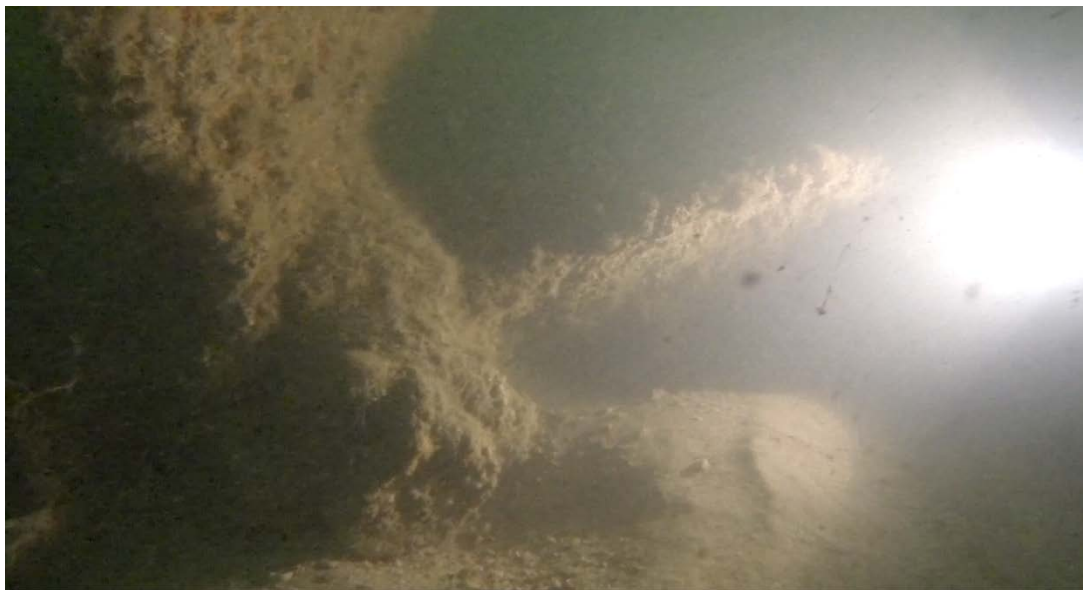
Figure 10: Propeller on seabed

The condition of the Westville is consistent with what might be expected of a wreck that has survived the natural processes within the area in which it lies for nearly 100 years. Although the remains are partially broken down some aspects of the ship are still moderately preserved.