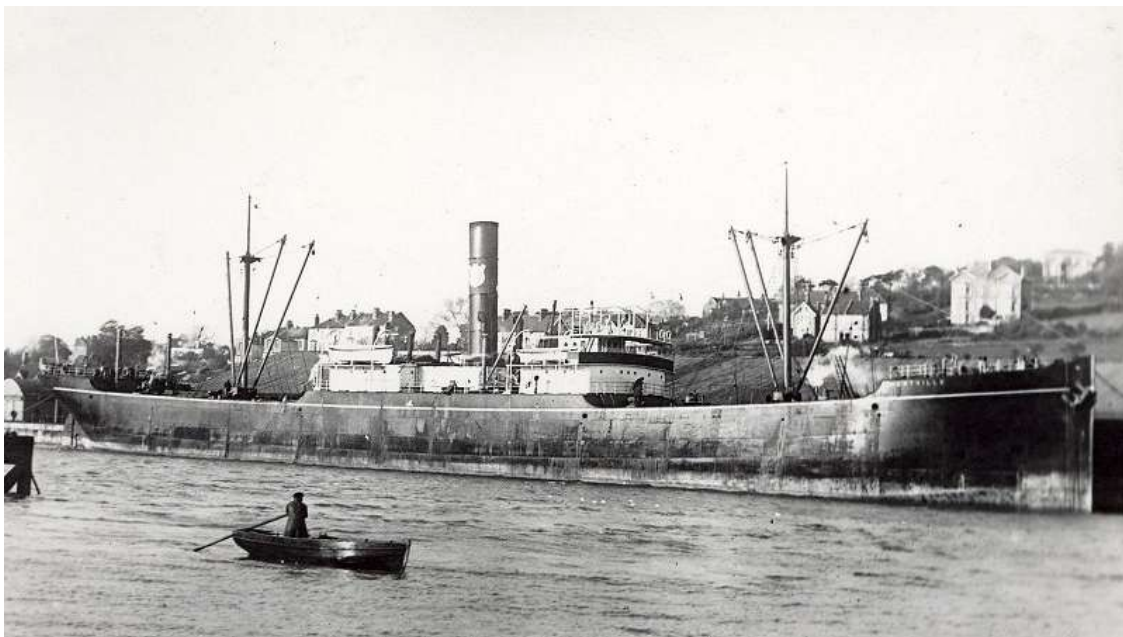
Figure 1: SS Westville

SS Westville was chosen as one of the Forgotten Wrecks case study sites because it represents an example of a steam ship of the day with a triple expansion engine, and was unenviably the last vessel to be sunk in 1917.