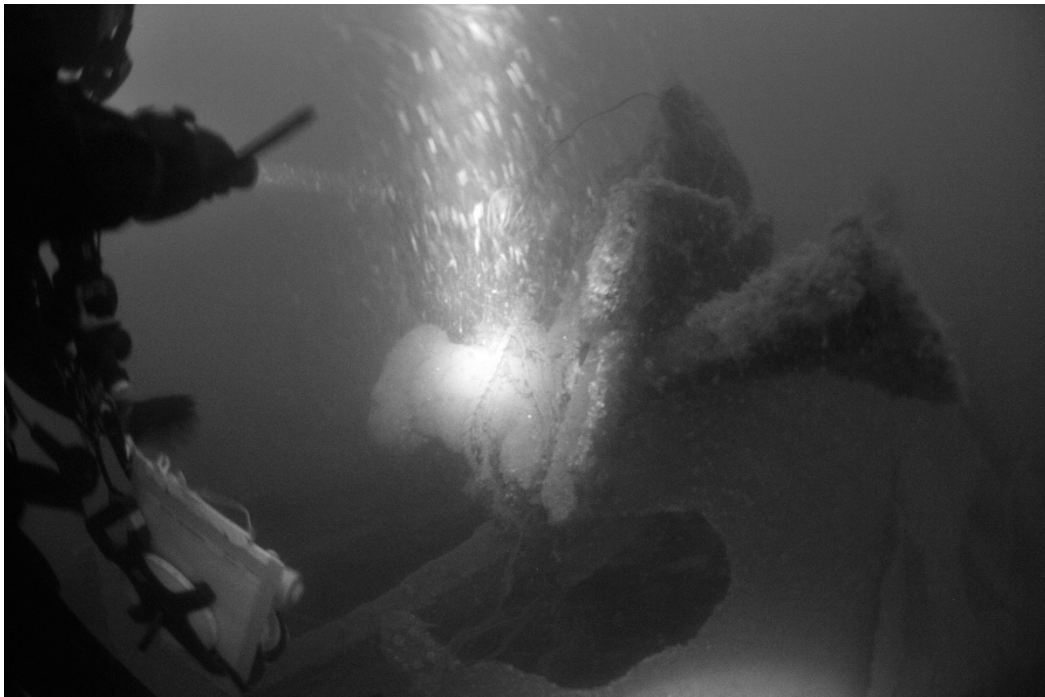
Figure 5: Bollard forward end of the wreck

Two bollards are apparent on both the port and starboard side of the forward end of the wreck (Figure 5) with a winch or windlass present near the bollards on the port side (Figure 6). Part of the winch is covered with rope still coiled around a drum.