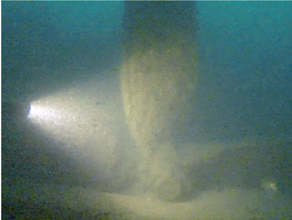
Figure 9: The four bladed propeller resting on the seabed